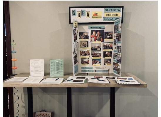
SREA Happy Hour, August 14, 2025