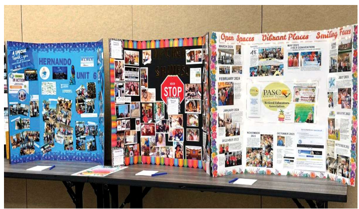
(left to right) Hernando, North Pinellas, and Pasco counties activity display boards

Each unit brought with them a display board showing all the different activities that their organization was involved in during the year. Fear not, North Pinellas, we represented well with a board full of happy shiny faces enjoying the monthly meetings, showing the activities and projects we are involved in, as well as the informative speakers we have each month.