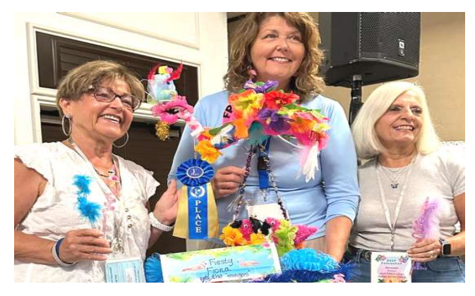
While teamed up with two ladies from the Daytona Beach area, I helped create "Feisty Fiona and the Mingos." Want to guess who won a blue ribbon?

After our district meetings, we had a chance to go back to our villas to freshen up and get ready for the "Tropical Southern Nights" themed dinner. A reception was held by AMBA. Randomly selected "creativity teams" participated in the "Feathering your Flamingo!" contest. Contestants created a one-of-akind exotic bird made with a flamingo yard bird and various crafts.