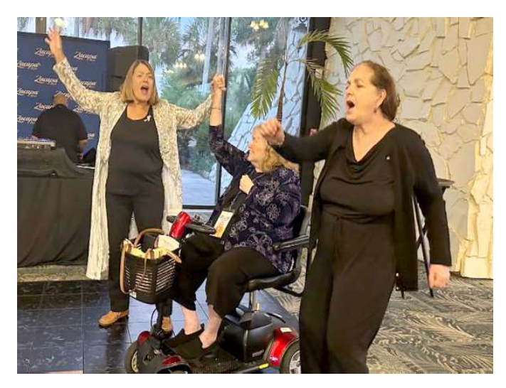
Our unit basket was won by a lovely woman from Martin County, who was getting ready to have a tropical flamingo party when she returned home.

The evening started out on the patio, and then a delicious buffet and dance music awaited us for the remainder of the evening. Lots of glittery outfits and smiling faces were seen at the gala.