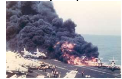
The Forrestal burns in July 1967

crew member of the USS Forrestal, who will tell us of the horrific events of July 1967, when the Forrestal caught fire in the Gulf of Tonkin.