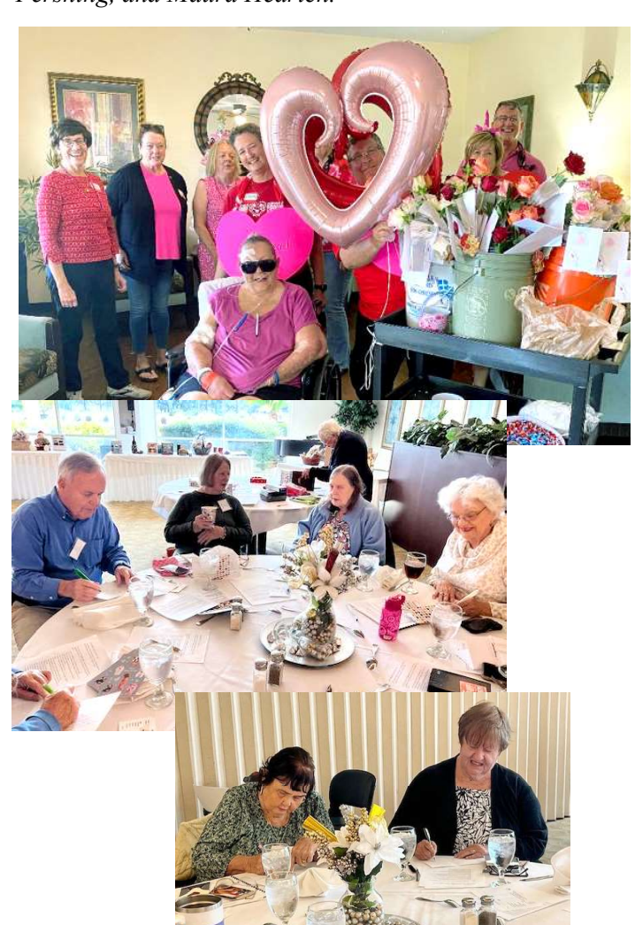
Members writing Valentine cards at the January luncheon.