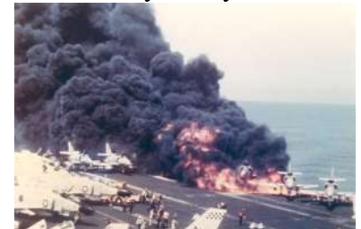
The Forrestal burns in July 1967