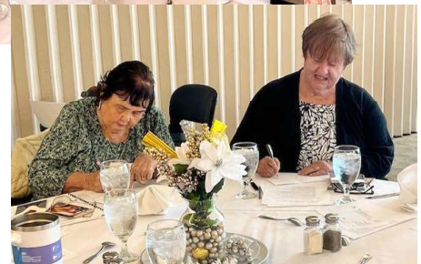
Members writing Valentine cards at the January luncheon.