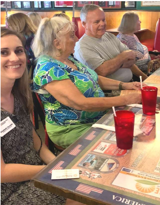
Tables of retired educators